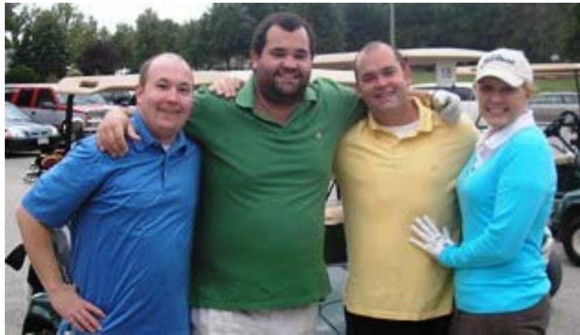
The Walker Team